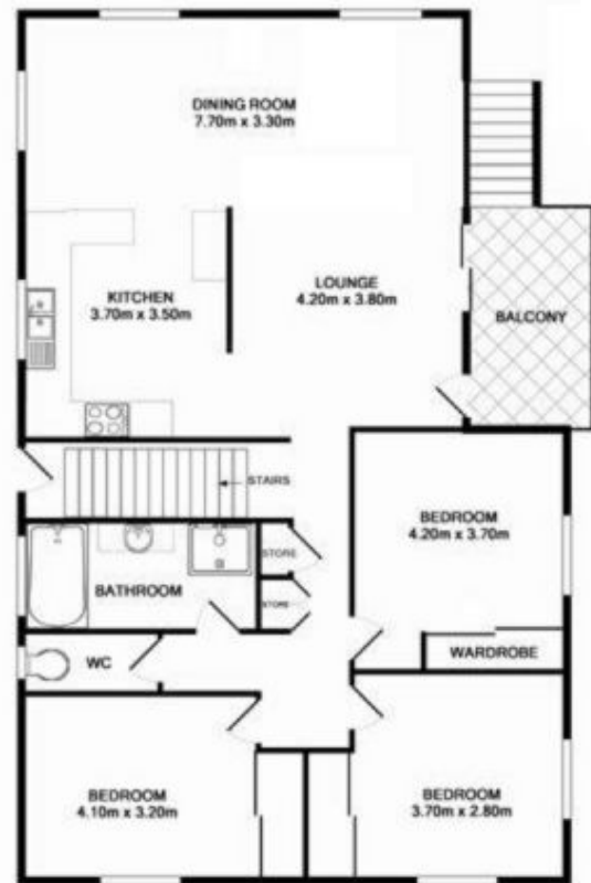
1ST FLOOR APPROX. FLOOR AREA 131.9 SQ.M. (1420 SQ.FT.)

TOTAL APPROX. FLOOR AREA 269.4 SQ.M. (2899 SQ.FT.)